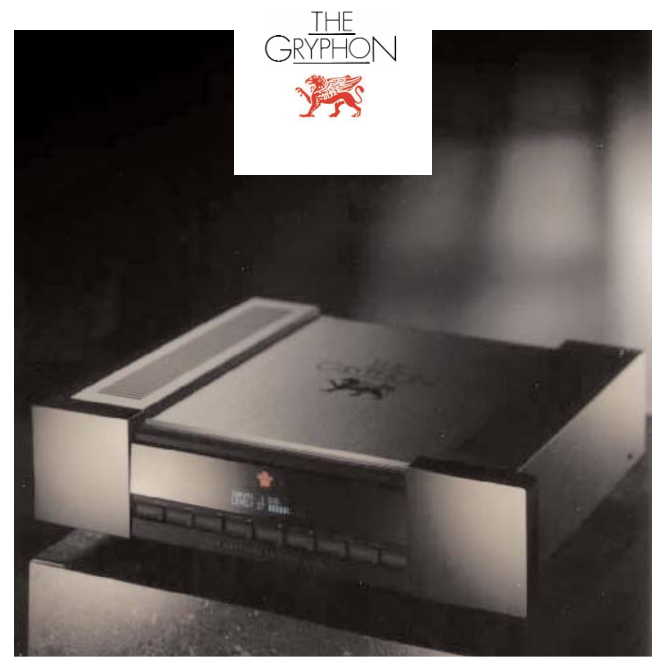
GRYPHON CALLISTO 2200