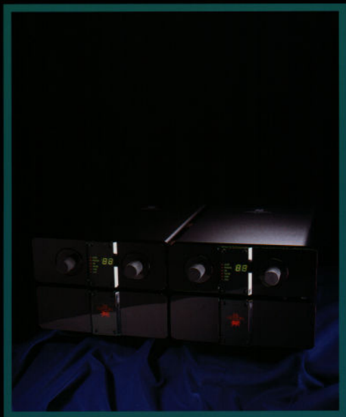
THE GRYPHON PREAMPLIFIER LIMITED EDITION