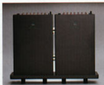
The Gryphon Preamp consists of two electrically independent audio channels in a true dual mono configuration.

The Gryphon Limited Edition Preamp was selected for the Title: "One of the most innovative consumer electronics products of 1990." "INNOVATIONS '90, DESIGN & ENGINEERING" CES Chicago; June 1990