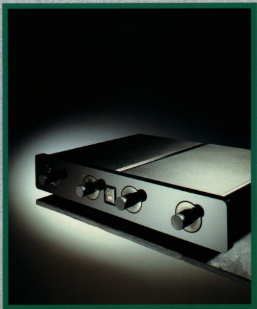
THE GRYPHON LINSTAGE