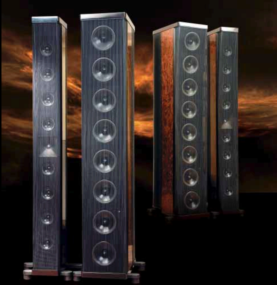
THE GRYPHON POSEIDON REFERENCE STANDARD SYSTEM