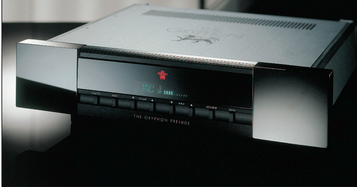
THE GRYPHON PRELUDE