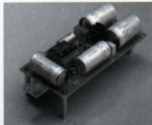
The Gryphon Preamplifier XT is a modular design with no internal wiring.