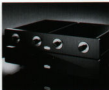
The Gryphon Preamplifier XT power supply incorporates 11-stage voltage regulation and dual-stage AC filtering for each channel.

The Gryphon Preamplifier XT is fitted with precision engineered WBT sockets for phono, CD, tuner, aux and tape. Due to its modular mainframe construction, the Gryphon Preamplifier XT is available in a line-level version, an MM version, incorporating the Gryphon Phono Stage, or an MC version, incorporating the Gryphon Phono Stage and the Gryphon Head Amp.