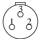
LEMO-Connector Solder side